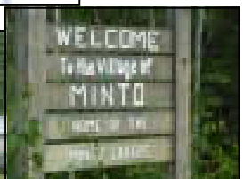
Minto was 150 miles (40 miles of gravel road.) NW of Fairbanks. Bill was a good Samaritan a native lady.