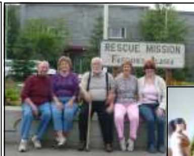
We slept at the Rescue Mission It was very close to the park!