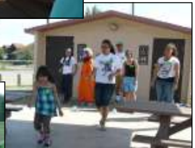
Hearing Bible Stories & hanging out