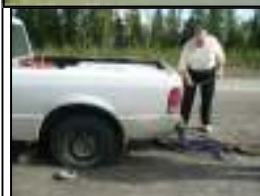
Our team on the Denali Hwy. which was 135 miles of gravel road between Cantwell & Paxson— beautiful scenery!!!!