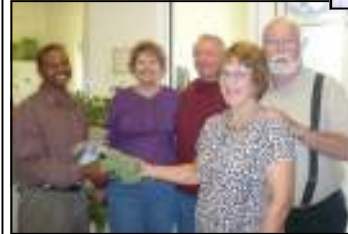
Thanks to Crossroads Methodist Ladies we were able to give the rescue mission lots of knitted winter wear!